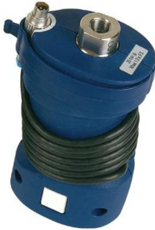
External IDOS universal pressure module

*Provides absolute pressure option in addition to gauge pressure. In absolute mode adds barometric pressure to gauge pressure range. For absolute mode ranges below 1 bar please consult your sales representative.