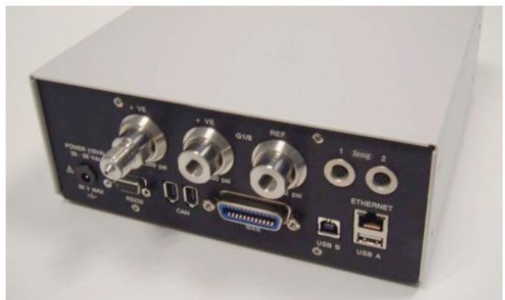
PACE1000 from the rear

Premium precision – IRS2 Reference precision – IRS3 Standard precision – IRS0-B High precision – IRS1-B Premium precision – IRS2-B Reference precision – IRS-B