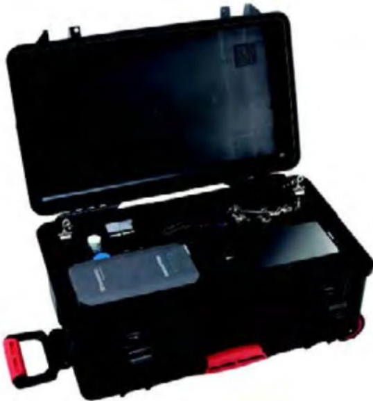
Optional hard shell carrying case