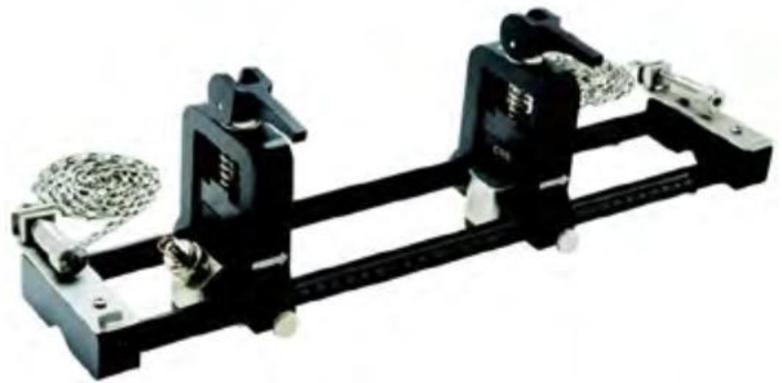
Clamp-on fixture with CRR transducers