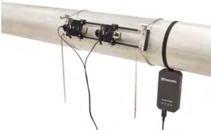
Clamping fixture, transducers and transmitter mounted on pipe