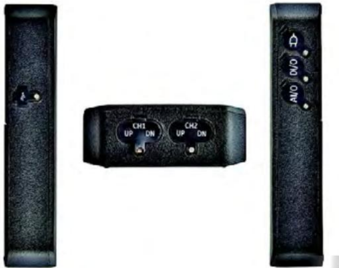
Transmitter electrical connections

Bluetooth® or wired (wired for Android only)