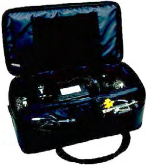
Standard soft shell carrying case