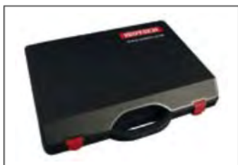
931-22-100 Optional Carrying Case