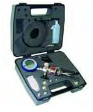
Hydraulic test kit