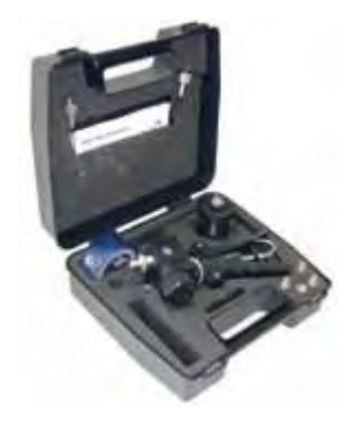
Pneumatic and hydraulic test kit