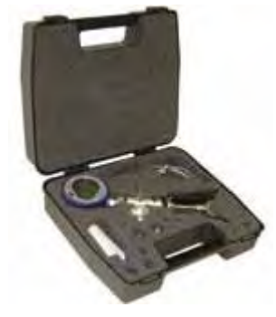
Pneumatic test kit